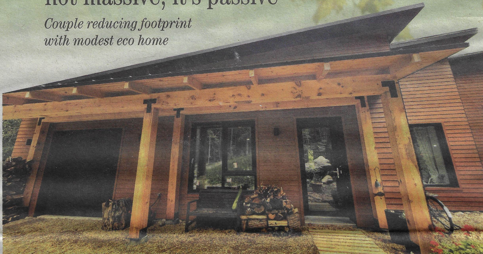
This passive home in Chelsea was designed by EkoBuilt and constructed by Wakefield builder Marilyse Bisson of Mavie Construction. The modest, 1,700 square-foot home, including a garage, boasts triple-pane floor-to-ceiling windows, 15-foot ceilings and a high-efficiency wood stove.

Young and Audet's passive home might not be what you'd expect for a new build in the Chelsea Highlands development in Larrimac. It's not a monster mansion pushing the 300-square-metre limit; it doesn't have spectacular views of the Hills or a giant balcony overlooking Gatineau Park. But it is nestled into nature and takes advantage of the south-facing lot with triple-pane, floor-to-ceiling windows, double-framed walls for added insulation and sealed doors and windows for an "air-tight" home.