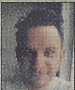
by Trevor Greenway

Couple reducing footprint with modest eco home